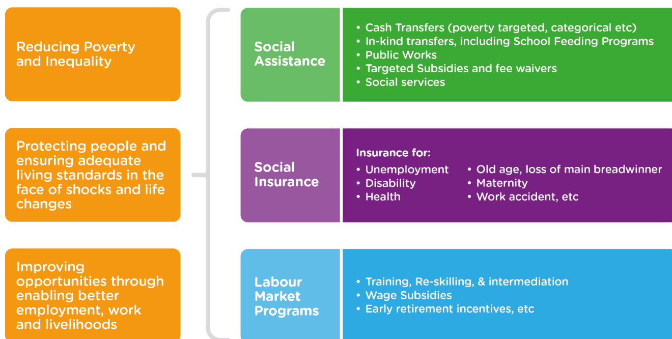
Figure 2. Social protection objectives and instruments